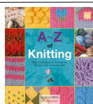
A-Z of Knitting