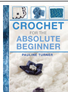
Crochet for the Absolute Beginner